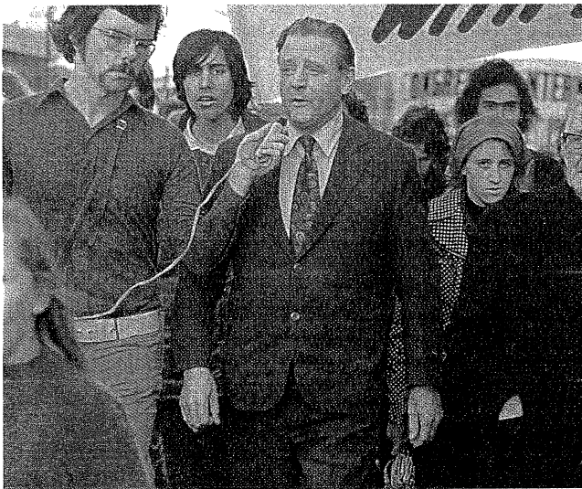
Photograph of Dr Cairns in 1972 at a demonstration against French nuclear testing