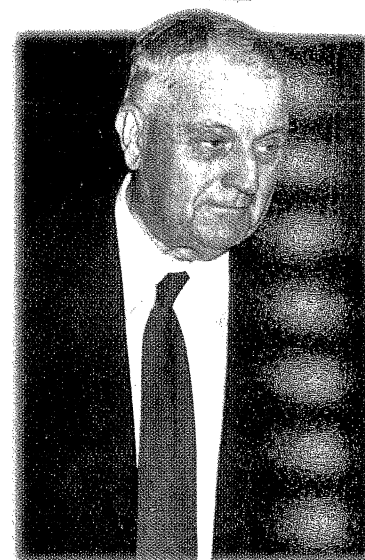
Rex Connor during his time as Minister for Minerals and Energy

From late 1974, Rex Connor had been attempting to obtain a loan from financial sources in the Middle East. Officials within the Treasury Department disapproved because they believed loans should be obtained only from traditional sources in the United States or the United Kingdom. On 20 May 1975, the Executive Council completely withdrew its permission for this loan. Connor was so committed to his dream of 'buying back the farm' that he continued trying to obtain a loan.