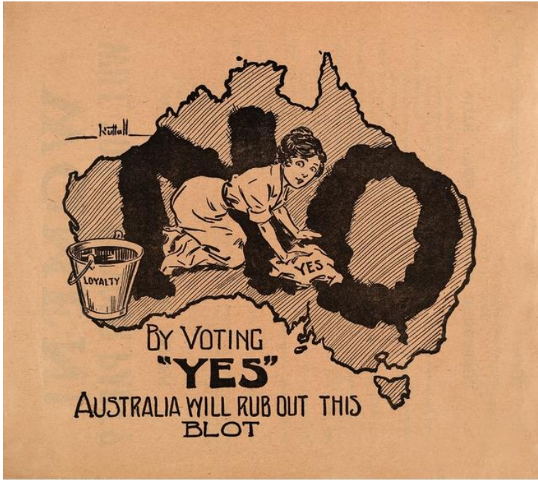
AUSTRALIAN WAR MEMORIAL RC00319